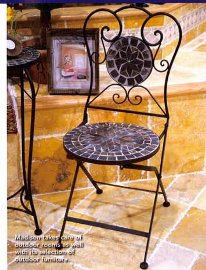
Madison takes care of outdoor rooms as well with its selection of outdoor furniture.