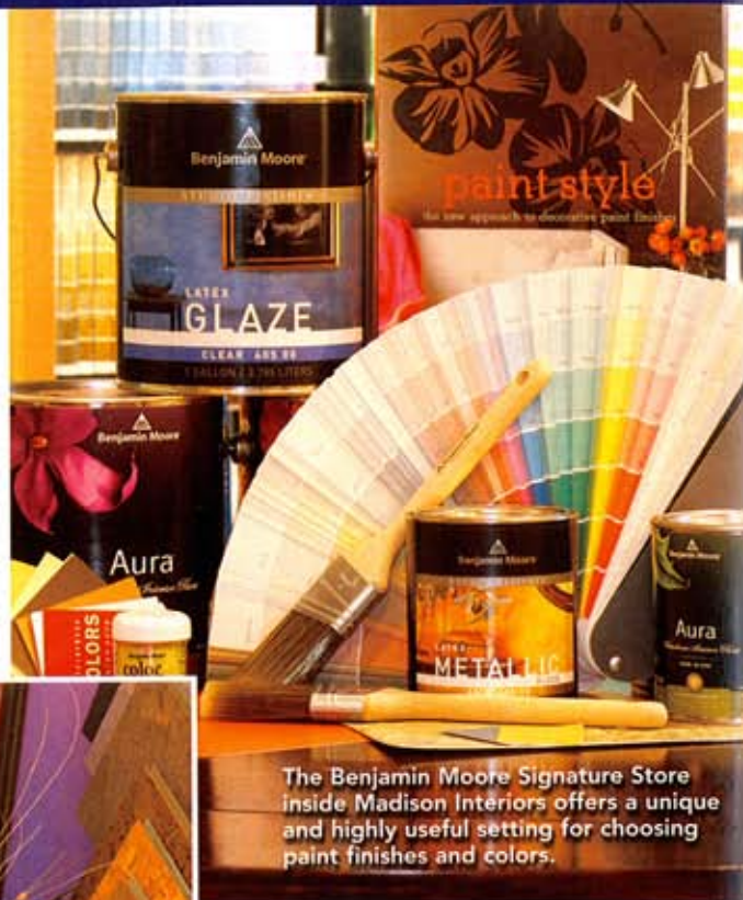
The Benjamin Moore Signature Store inside Madison Interiors offers a unique and highly useful setting for choosing paint finishes and colors.

What's up in color for 2009? According to Small and Alaghebandian, current paint trends are reflected in a series of color palettes proposed by Benjamin Moore that are showcased in Colors for Your Home , a free, helpful booklet available to Madison customers. While 18 colors are fore-