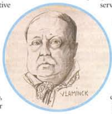
Walls are not overlooked at Madison; exquisite, hard-to-find artwork available for purchase graces the showroom.

Annapolis, Baltimore and Metro D.C. homeowners can breathe a sigh of collective relief. Madison Interiors, a new home fashion and décor business that opened in August, is a one-stop-shopping experience offering customers everything from furniture and accessories to sources for eco-friendly home design and remodeling products. With hundreds of suppliers and manufacturers available, consumers no longer need to schlep from store to store in search of that perfect leather sofa, table lamp, bamboo flooring or wall color. And whether you are just refreshing the paint color in your great room or furnishing a brand new dream home, the team at Madison has