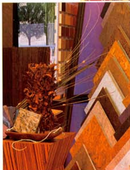
Madison carries a large selection of flooring—from bamboo that comes in over 30 colors to tile in all shapes and textures.

casted, Benjamin Moore has its eye on three predicted to be exceedingly popular. Among them is Blue Nose, a chic blue with a small measure of gray; Sea Haze, a gray tone with a tinge of brown; and Vellum, a subdued yellow, bordering on the color of wheat. "Colors for Your Home is filled with timely ideas and inspiration plus suggestions for decorative painting techniques," says Small. He also adds that customers should look for upcoming seminars on paint trends to be held at the store.